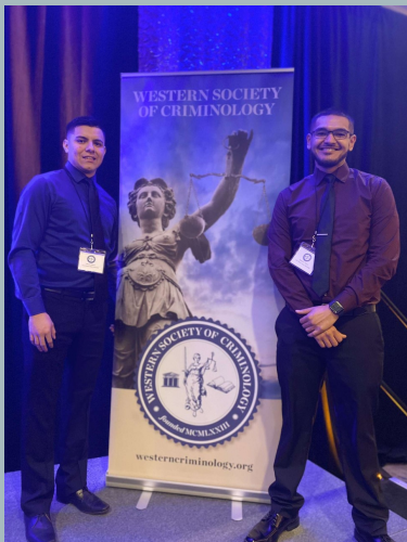
CJ Graduate Students presenting at the Conference