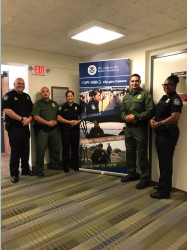
The U.S. Customs and Border Protection recruiting events in the CJ Mentoring Center