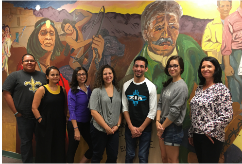
Students in BEST 510, Fall 2019