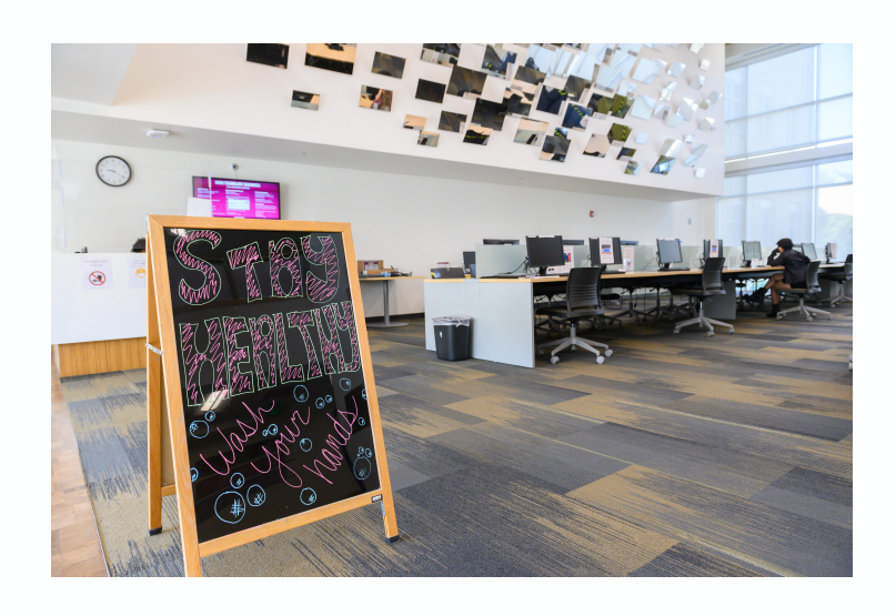
NMSU main campus computer center